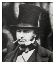
Brunel = Blue House