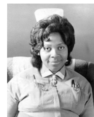
Campbell = Green House