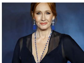
Rowling = Yellow House